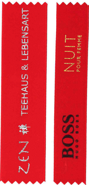
1 colour 2 colours