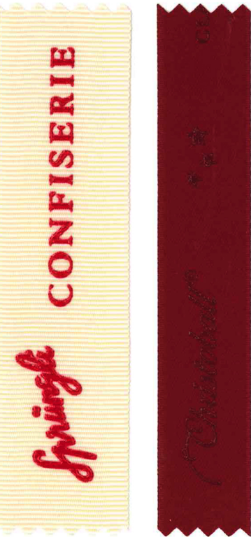
lacquer transparent lacquer