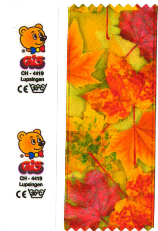
single sided double sided